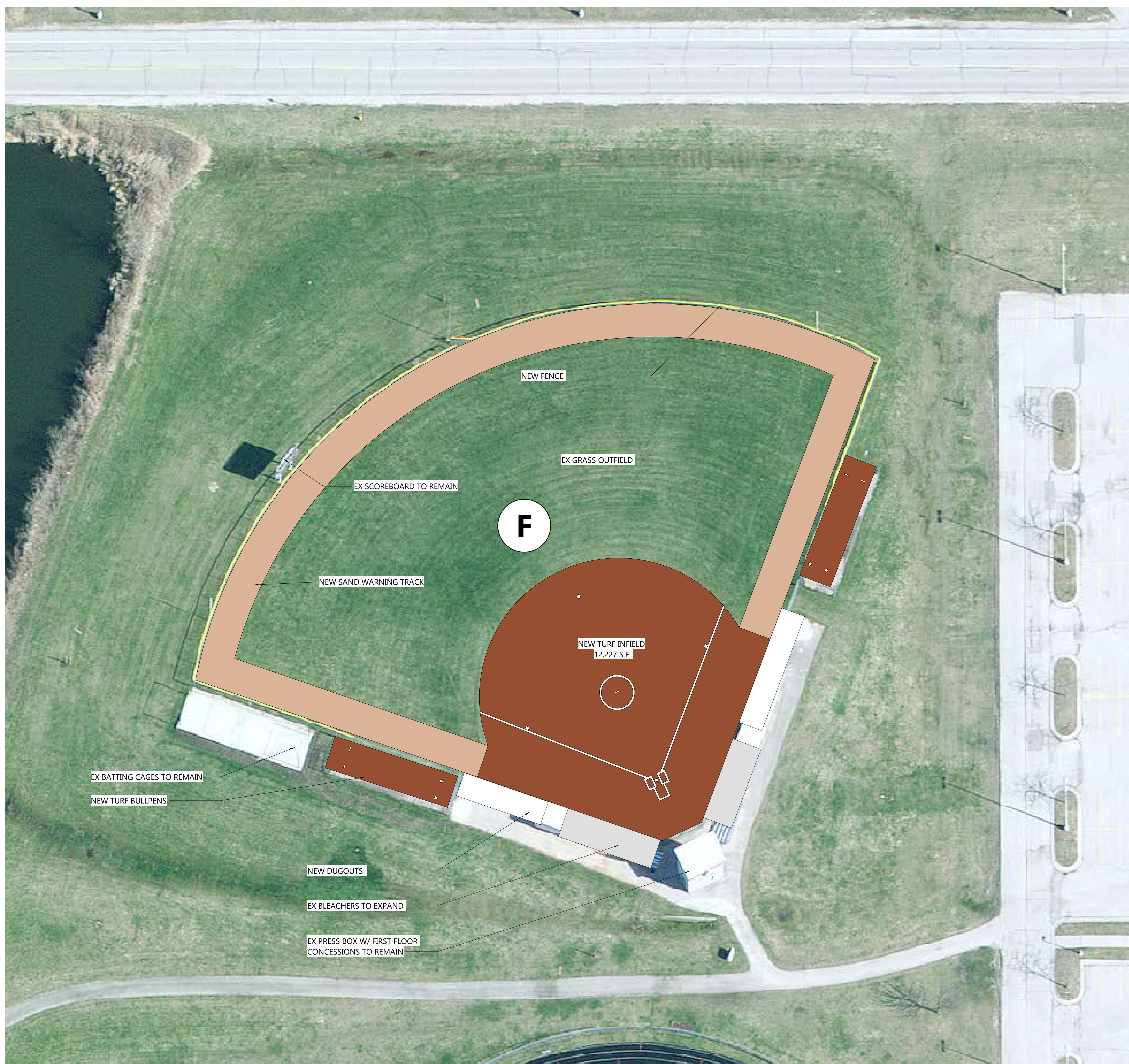
VARSITY SOFTBALL FIELD OPTION 1 NORTH SCALE: 1" = 20'-0" 0' 20' 40'